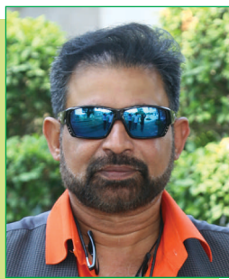
Chetan Sharma Legendary Cricketer