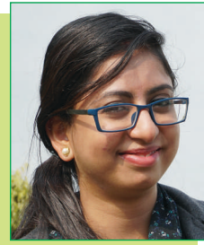
Chahat Teacher Learning center